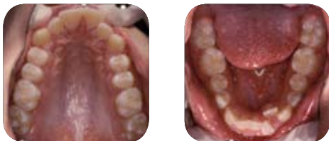
Maxillary and mandibular arches exhibiting constriction and moderate to severe crowding